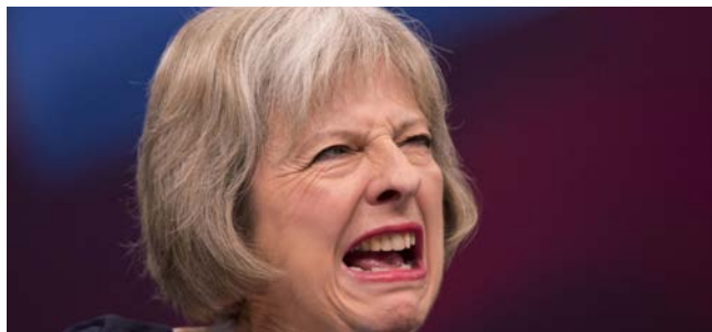
British Prime Minister Theresa May has told UK lawmakers that Article 50 will be triggered by the end of March.

There are dissenting voices in Scotland and Northern Ireland